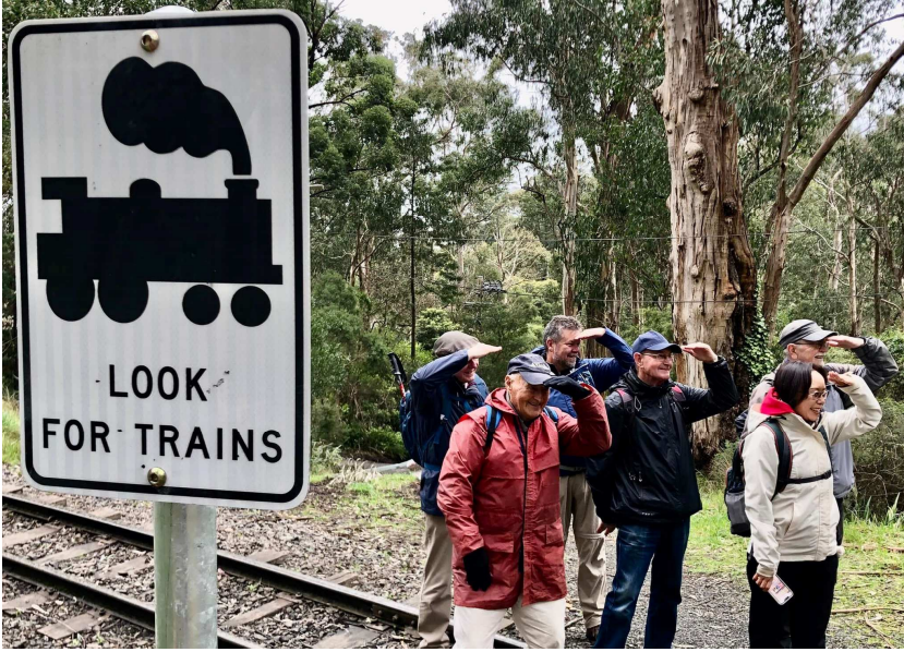
Look For Trains

If undeliverable, return to: Melbourne Walking Club Inc.