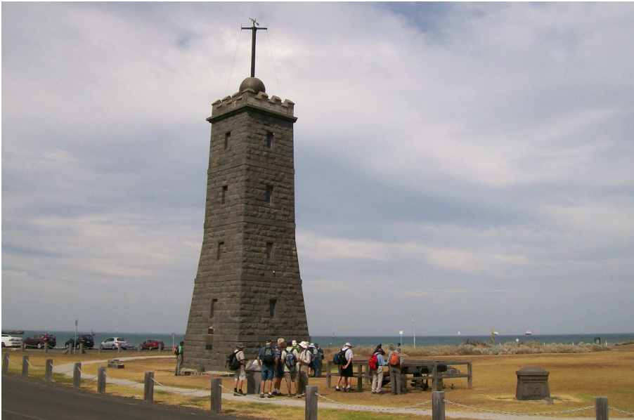
Williamstown TimeBall – March 2015

If undeliverable, return to: Melbourne Walking Club Inc.